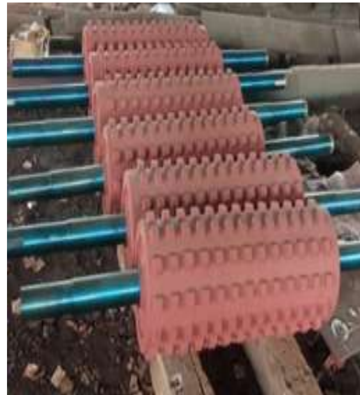
Rolls For Ash Crusher