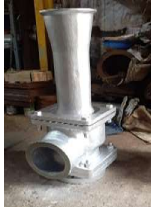
Jet Pump Nozzle