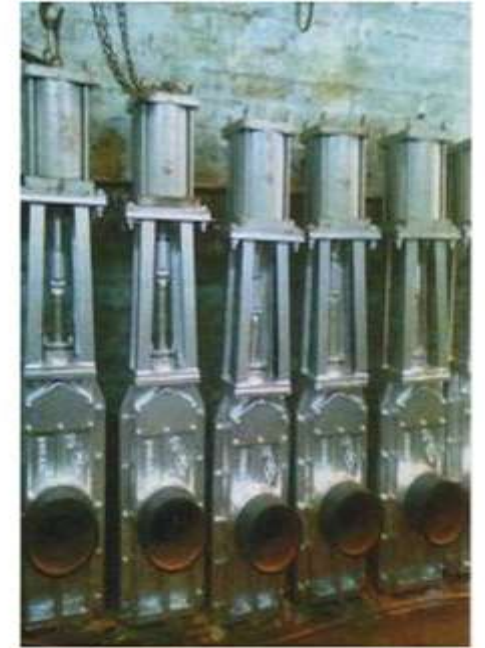
Branch Isolation Valve