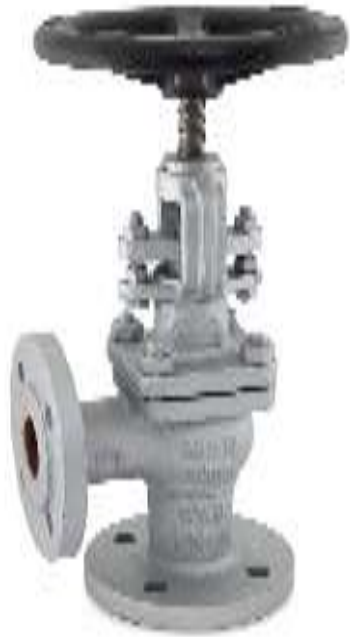
AHP valve & accessories including spares.