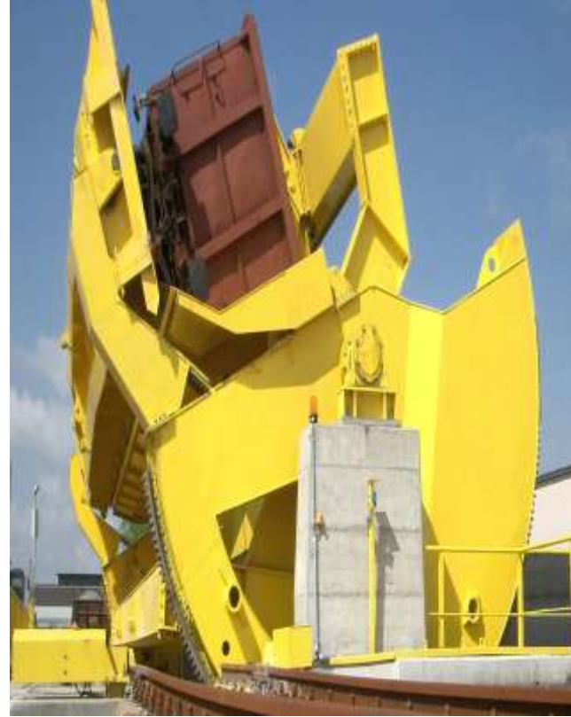
WT Side Beam