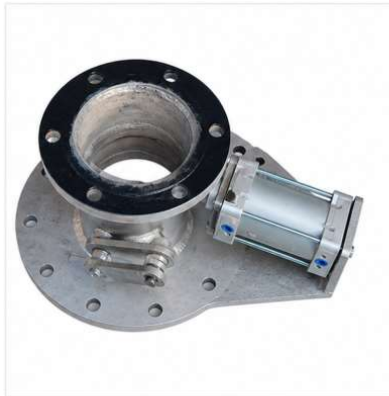
Ash Intake Valve