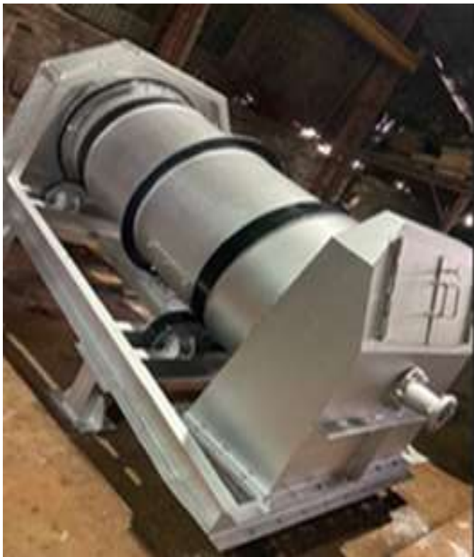
Rotary ash conditioner