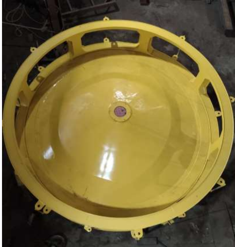
Bucket Wheel Structure